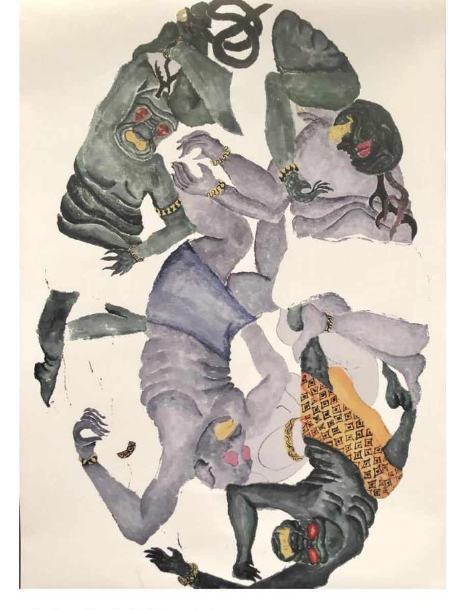
Artist - Mustafa Khanbhai Title - Mitochondria 3 (single edition) Medium - Digital collage printed on archival paper Size - 3 X 2 feet, 36 X 24 inches